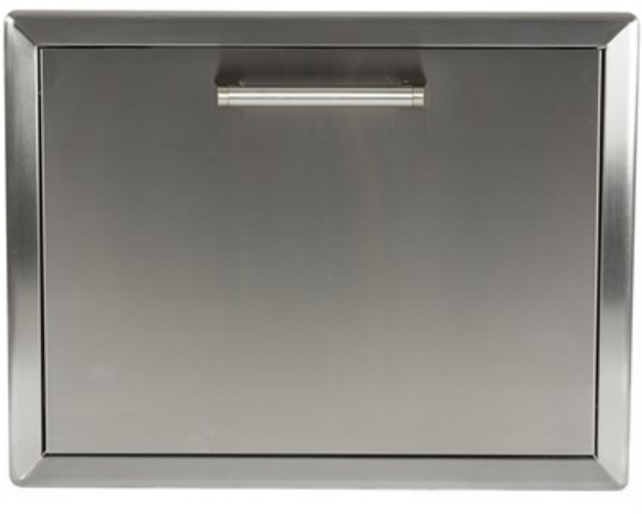
Pull Out Ice Chest